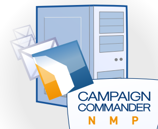
Notification Messaging Platform